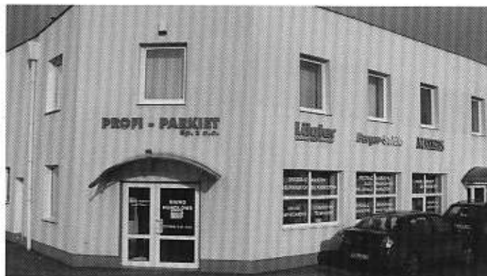
Profi Parkiet's present headquarters in Warsaw.

The 2-component water-based polyurethane finish from Berger-Seidle is by far the top selling product of the range according to Tomasz Kuciak. Varnish is still the main coating used on parquet installed in Poland. However, oil application has risen to 10%, restrained only by problems with maintenance.